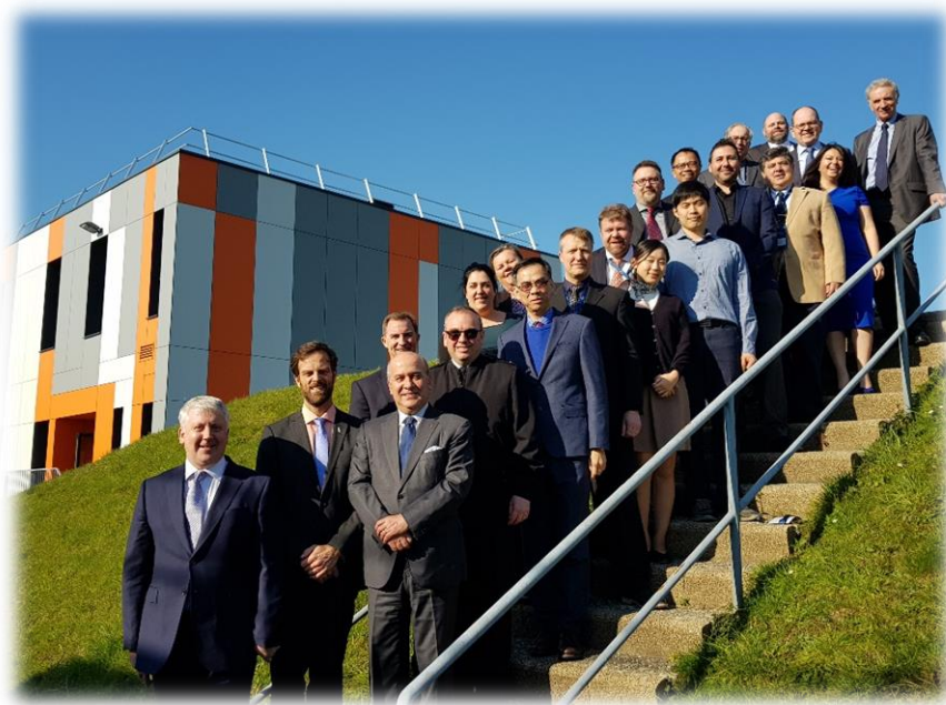
WENDWG-9 participants at Shom, Brest, France

The 10 th meeting of the WENDWG is scheduled to be held in Hong Kong, China, in February 2020.